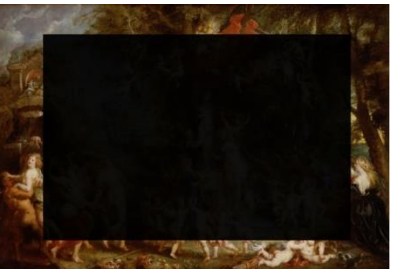
(L-R) Inga Krymskaya: Variation 5 // Triptych - mixed media on acrylic glass mounted on dibond – 180 x 100cm (each part) Variation 17 // 3D parts, mixed media and watercolor on wooden panel - 200 x 92cm Variation 20 // Mixed media on wooden panel, 3dim work

The artist, <u>Inga Krymskaya</u>, is announcing an international call to artists to participate in her latest project, 3045 Variations on The Feast of Venus.